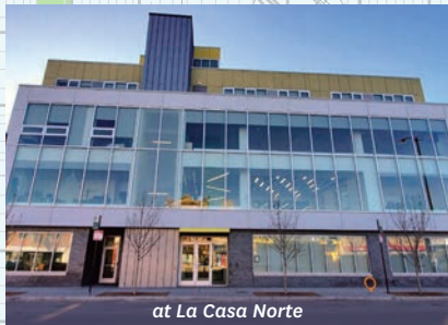
at La Casa Norte