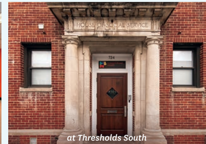
at Thresholds South